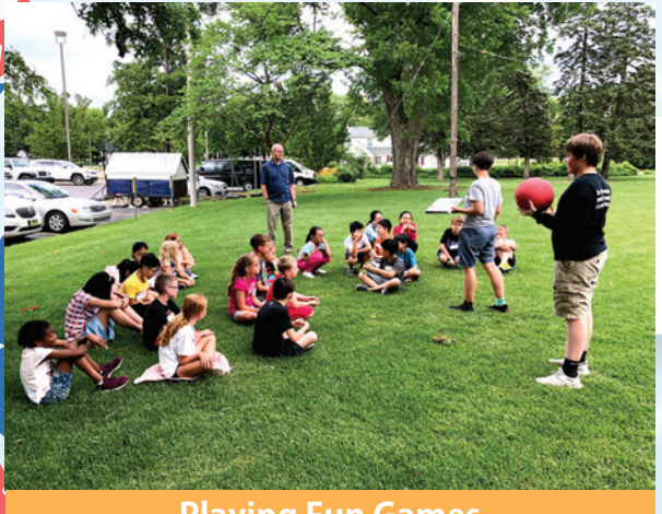
Playing Fun Games

非常感謝學校對這次活動的策劃!孩子經歷了一次有意 義的旅程,通過這次活動,希望孩子長大後也有一種擁 有愛心及奉獻愛心的精神。